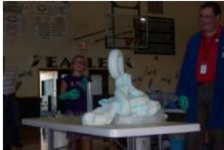
Pictured above are fifth-grade students creating "Elephant Tooth Paste"

The ANGUS chemical company recently launched their partnership with local schools at OCS with a presentation to our fourth and fifth graders. The program is called Science is pHun . The program is designed to expose students to the world of science through a series of chemistry demonstrations & experiments and to generate enthusiasm for learning how chemistry is a part of their everyday lives. Safe handling of chemicals and the significance of education are the primary focus of the demonstrations, which expose students to science through hands-on and visual learning methods.